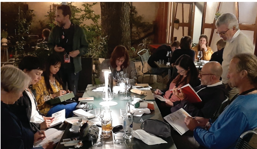
9.9.2022 / Dinner for workshop leaders and organization.

The workshop leaders really appreciated meeting and drawing with each other during dinner at a local restaurant on Thursday evening.