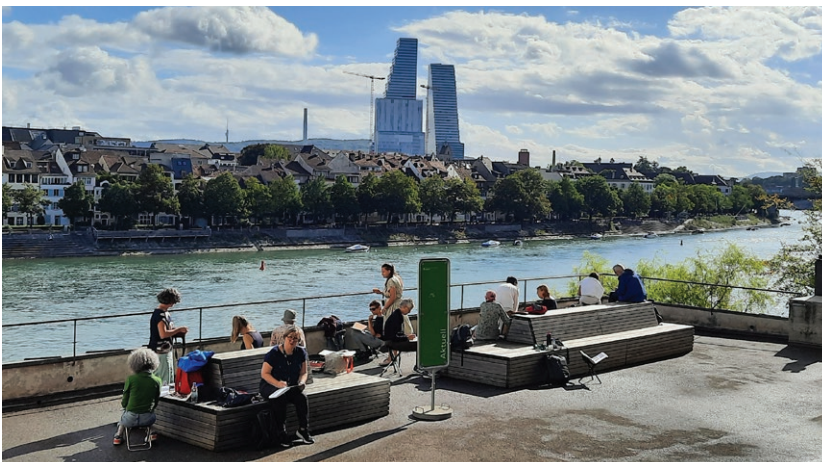
9.9.2022 / Workshop by Olivia Aloisi at Rheinsprung

The sketchcrawl on Saturday afternoon close to the Rhine in the Kaserne area was open to the public including sketch exhibition, auction and aperitif.